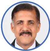
Prof. Roy Abraham Kallivayalil

The theme of the Congress, "Social determinants of mental health and access to care" is contemporary and relevant. It reflects our concern for mental health in this age of globalization, commercialization and the merging of boundaries between nations.